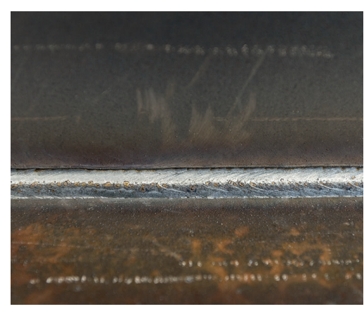
The detailed view also shows how even the weld seam performed by the tractor is.