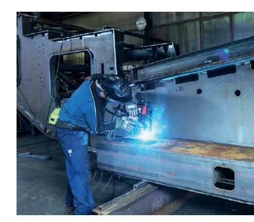
Set up the unit, adjust the values, and start welding. A magnet allows easy fastening of the tractor, while a high-performance motor ensures a precise welding speed.